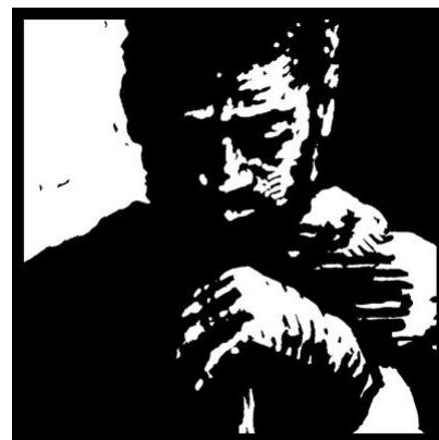
August 14, 2016

RE begins with Mass and Backpack Blessing on August 24 at 6:15 for all grades and their families. Following Mass is an informational meeting covering the RE Handbook and calendar.