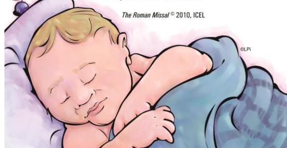
The Roman Missal © 2010, ICEL

God our Creator, we give thanks to you, who alone have the power to impart the breath of life as you form each of us in our mother's womb; grant, we pray, that we, whom you have made stewards of creation, may remain faithful to this sacred trust and constant in safeguarding the dignity of every human life. Through our Lord Jesus Christ, your Son, who lives and reigns with you in the unity of the Holy Spirit, one God, for ever and ever.